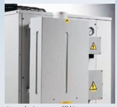
Atmospheric pressure fill kit

This kit (from 015) is simply installed onto the back of the chiller itself, and features a generous tank (with an easy to read water level indication) encased within a tough galvanized steel cabinet. A tap offers easy chiller water tank filling. The fill kit is standard on models M03-10.