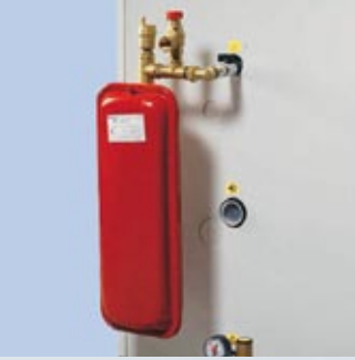
Pressurized fill kit

This kit, available from model 015, is used in pressurized water circuit applications (up to 100 psig). The kit features all components required for safe and easy operation, including a pressure reducer, water inlet valve, pressure gauge, automatic relief valve, safety valve and expansion tank.