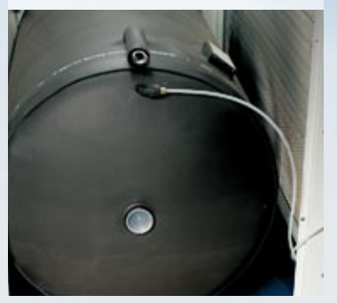
Large buffer tank

The large tank and evaporator ensure steady water temperatures, even during sudden load variations. This is further enhanced by passing the water through the evaporator before entering the tank, offering a ready chilled water supply. HP, LP and water manometers (from 031) give a quick overview of status.