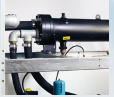
Shell & tube condenser

Water-cooled models, supplied as standard with cUL listing, offer elevated energy efficiency (EER) levels, and are well suited to hot ambients or for indoor installation. Noise levels are also reduced notably.