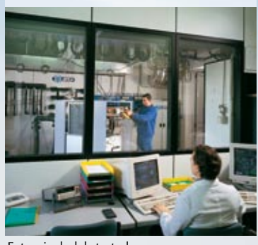
Extensively lab tested

All models are individually waterside tested at nominal operating conditions, and also undergo operating tests, refrigerant charge and leakage controls, and microprocessor and safety device setting verifications. Leading brand components are used throughout, ensuring long term reliability.