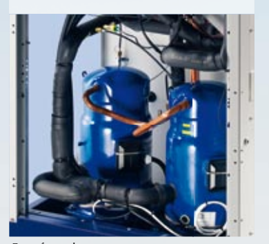
Easy frontal access

Water inlet limits of 23°F to 95°F and outlet limits of 14°F (32°F on M03-10) to 86°F ensure TAEevo is suited to all industrial applications. IP54 protection (from 031), full frontal access, easily removable panels and a separate refrigeration compartment (from 015) facilitate ease of use.